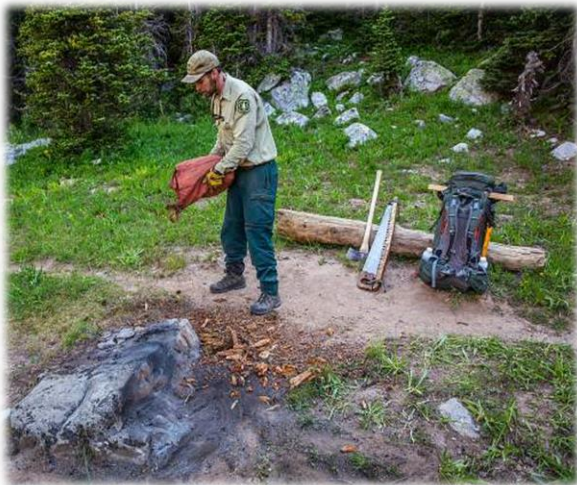
FIGURE 6 RANGER NATURALIZING A FIRE SCAR

Maintenance work provides safe and sustainable infrastructure for visitors. Rehab work restores the natural quality of heavily impacted areas.