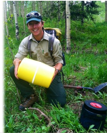
FIGURE 3 BEAR CANISTER EDUCATION