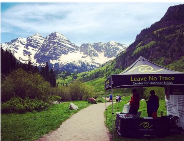
FIGURE 2 TRAVELING LNT BOOTH AT MAROON LAKE

Ethics education prevents degradation of the physical and social Wilderness resource by uninformed visitors. Education is the Wilderness program priority.