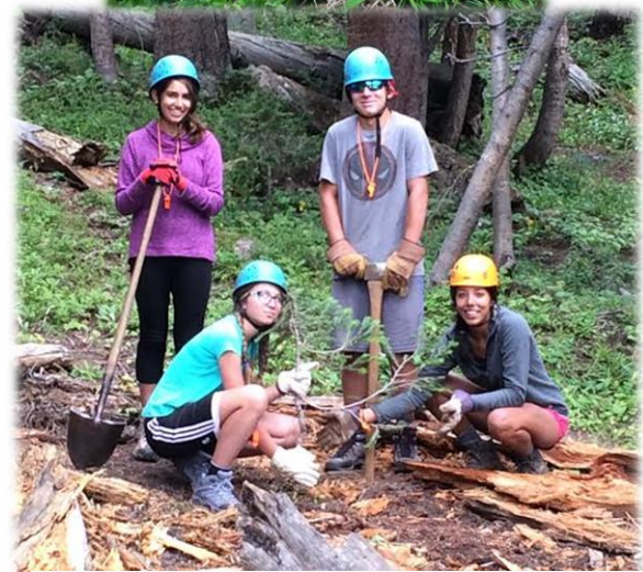
FIGURE 4 COLORADO ROCKY MOUNTAIN SCHOOL FRESHMEN ON A SERVICE PROJECT