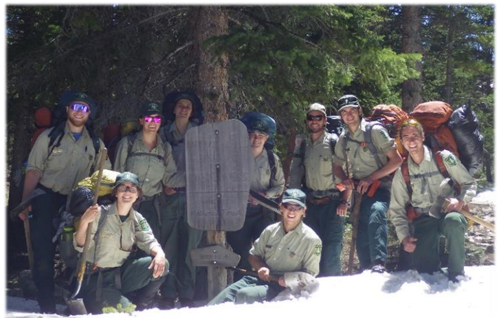
FIGURE 1 RANGER TRAINING INCLUDED TRAIL CREW MEMBERS